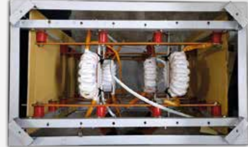
INTERNAL SECTION OF SERVO CONTROL VOLTAGE STABILIZER